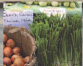
ALPINE VILLAGE FARMERS MKT