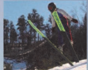
TRI-NORSE SKI JUMP