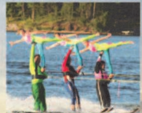
SHERMALOT SHOW TEAM